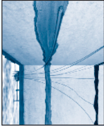
Illustration: D. Fierstein, Statoil