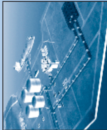
Illustration: BÜG, Statoil