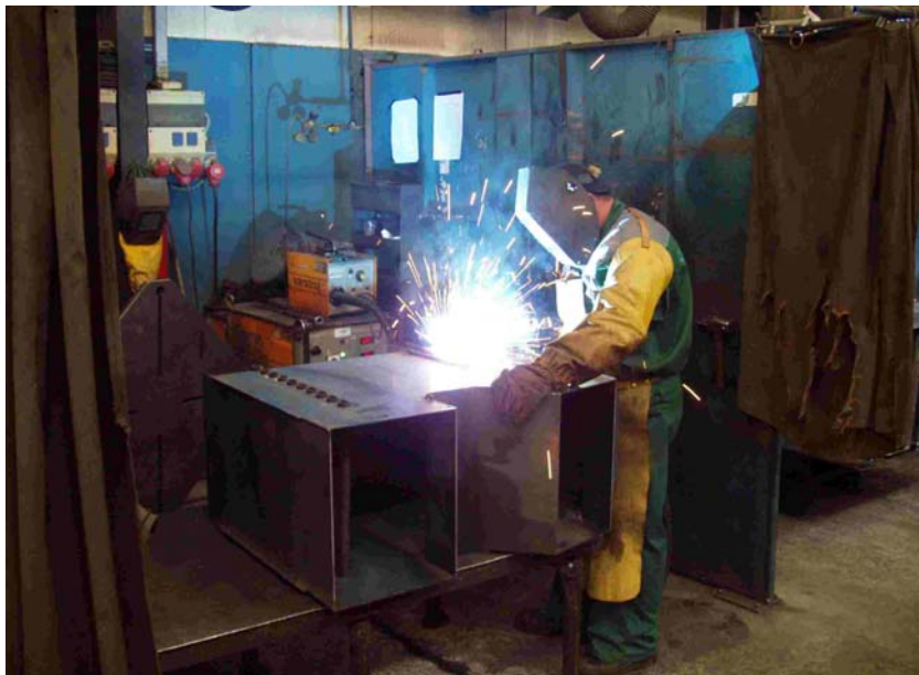
Household pellet stove production in Macinec, Croatia

Additionally, specific aims of Task 29 include synthesis of its findings on both the social and economic drivers and the impacts of establishing bioenergy markets, and transferring to stakeholders the critical knowledge and new information obtained. The Task works also to improve the assessment of socio-economic impacts of biomass production and utilisation in order to increase uptake of bioenergy and provide better guidance to policy makers. Activities focus on stakeholder involvement, local income creation, public acceptance, local NGO involvement, long-term financial and political support, technology transfer and diffusion, and distribution of benefits.