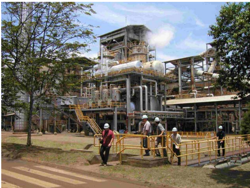
Large-scale ethanol production, Barra Grande, Brazil (J. Domac)

A Task workshop in Japan in 2004 was devoted entirely to use of biomass in urban communities, with the objective of facilitating exchange of information and knowledge on the latest developments and achievements in participating countries; it also included participation of invited experts outside the Task. One of the conclusions of this workshop was agreement to produce case studies illustrating opportunities for biomass use in urban communities, best practice procedures and socio-economic drivers. Several case studies are already completed or near completion and will be downloadable in pdf format from the Task website by the end of 2005. Building national, regional and international partnerships for implementing bioenergy projects is likely to play a very strong role.