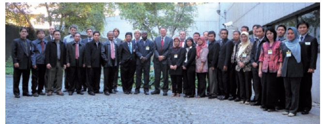
Indonesian officials participate in a training session at IEA Headquarters